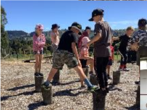
Team Building challenges - a chance to show off our manawaroa & whanaungatanga skills