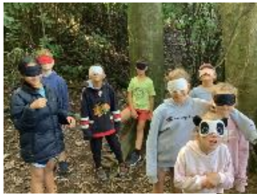
Ready to make our way around the Burma Trail