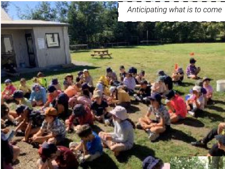
Anticipating what is to come