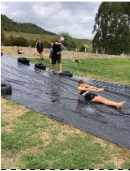
The Water Slide was a big hit with children and adults